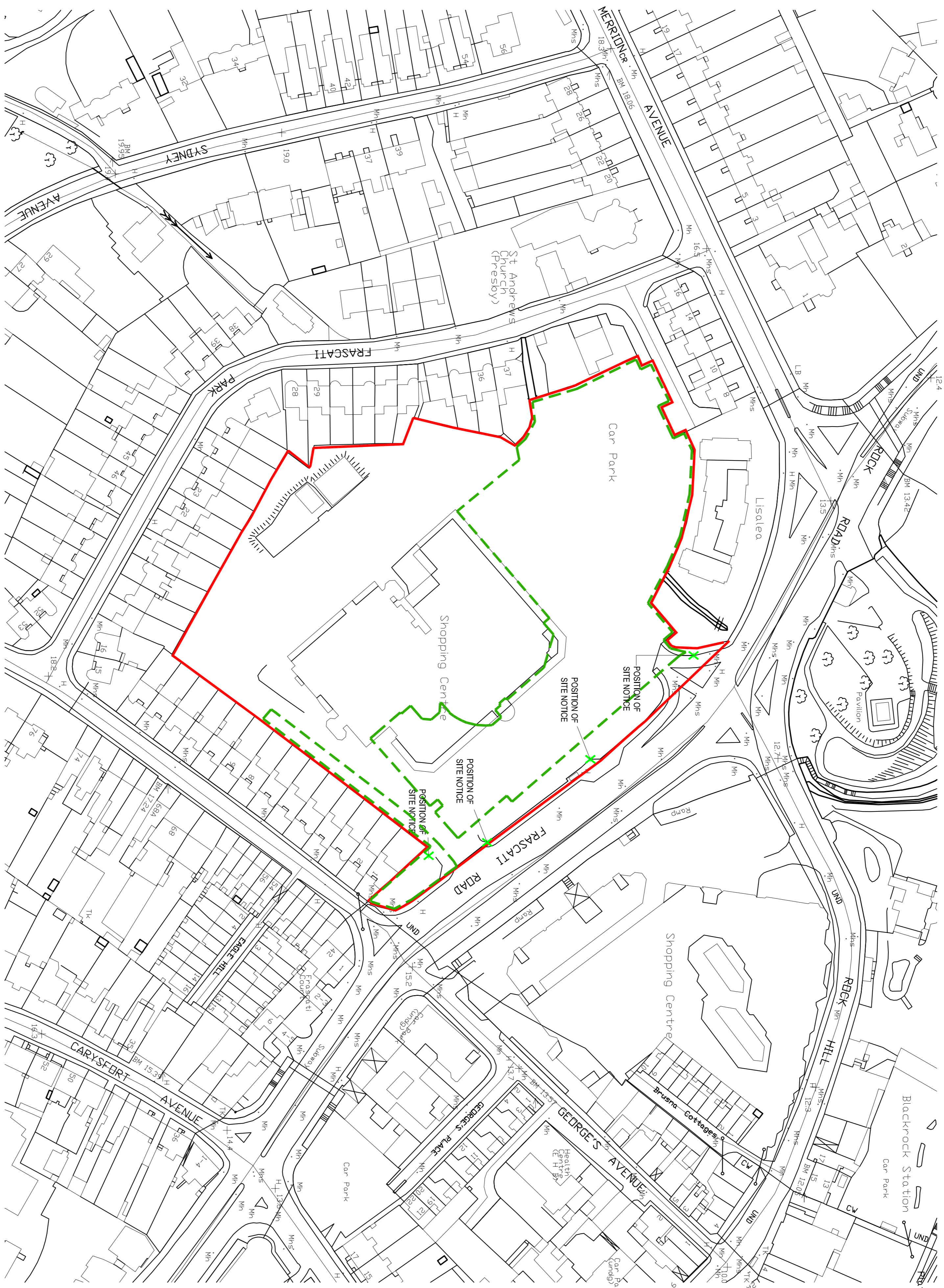
1 SITE LOCATION MAP 1:1000

DO NOT SCALE FROM THIS DRAWING. USE FLOORED DIMENSIONS IN ALL CASES. VERIFY DIMENSIONS ON SITE AND REPORT ANY DISCREPANCIES TO THE ARCHITECT. THIS DRAWING IS THE PROPERTY OF REDDY ARCHITECTURE + URBANISM AND IS NOT TO BE REPRODUCED OR TRANSMITTED IN ANY FORM OR BY ANY MEANS, ELECTRONIC OR MECHANICAL, INCLUDING PHOTOCOPYING, RECORDING, OR BY ANY INFORMATION STORAGE AND RETRIEVAL SYSTEM, WITHOUT THE WRITTEN PERMISSION OF REDDY ARCHITECTURE + URBANISM.